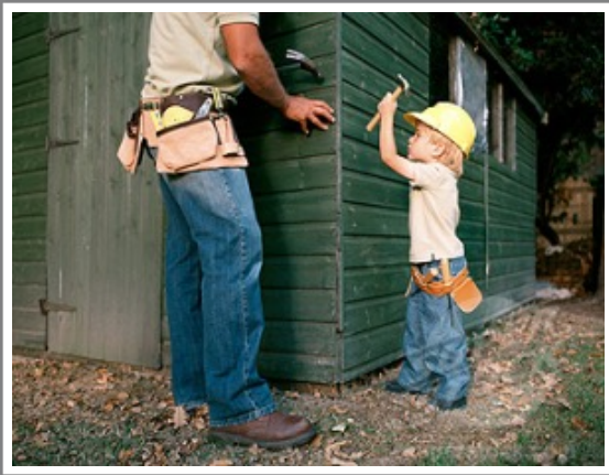
Children emulate their parents' behaviours

All people walk each in the name of his god. What does this mean? If “name” means character then this means that our characters become like the character of the God we behold. Just like children imitate their parents we imitate God, our heavenly Father. We copy God’s behaviour, we emulate His motives and we become replicas of His character. How important is it to have a